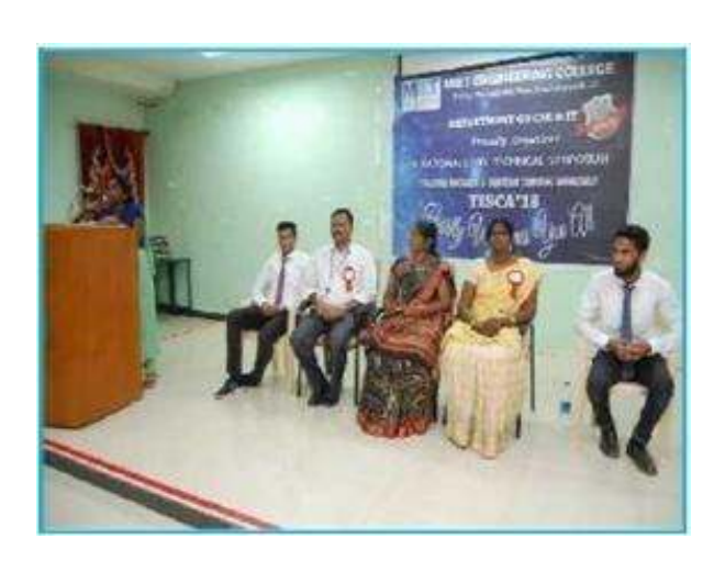
TISCA-'18 Valedictory function