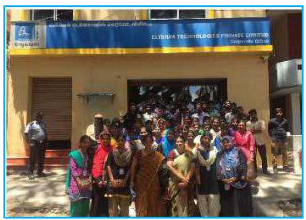
Industrial Visit at Elysium Technologies