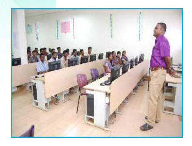
Resource person addressing the students