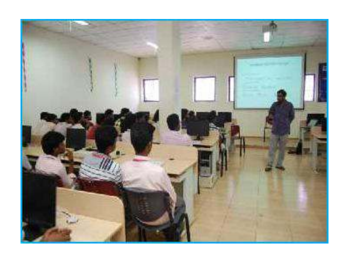
Students attending workshop