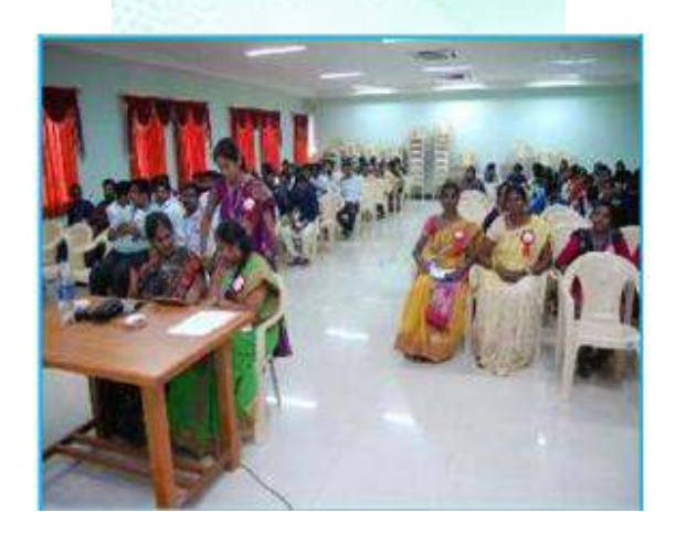
Paper presentation in TISCA-18